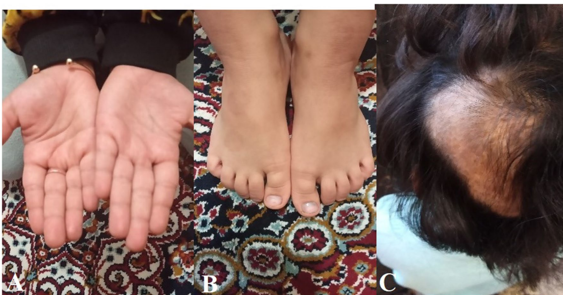
Fig. 3 Patient's palms lesions (A), granuloma annulare lesions (B), and alopecia areata (C) after 3 months of pharmacotherapy

Atopic dermatitis is a relatively common skin condition in children. There are four primary criteria for diagnosis of atopic dermatitis: pruritic nature, characteristic involvement of the head and flexor areas in younger children and extensor areas in older children and adults, chronic and relapsing course, and personal and familial history of atopy [13]. On the basis of the patient's physical examination, the findings did not meet the criteria of atopic dermatitis. They did not have a history of other allergic conditions such as asthma, known as the atopic march. Regarding the involvement pattern of eczema in our case, a study by Agner et al. concluded